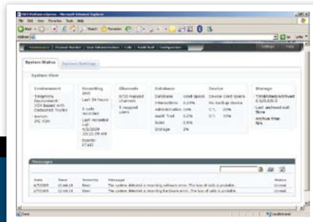
Figure 2: NICE Perform eXpress Applications

Each NICE Perform eXpress provides its services to its local site independent of the other NICE Perform eXpress solutions deployed in other parts of the organization. A single storage server may be used by all NICE Perform eXpress systems in the organization but each system manages its own archived interactions. The standalone NICE Perform eXpress is installed and controlled locally. The standalone solution is beneficial for small to medium scale organizations with independent sites.